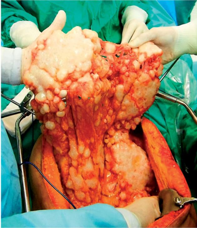
Figure 1. Malignant peritoneal mesothelioma in the form of 'omental cake'. Despite the impressive appearance, these lesions are resectable.

The aim of this study is to present the experience of a referral centre for peritoneal surface malignancy in Greece in treating malignant peritoneal mesothelioma by cytoreductive surgery and HIPEC.